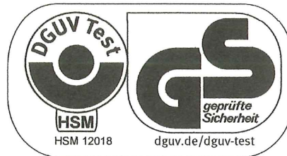
Approved design for a height of 20 mm or less: